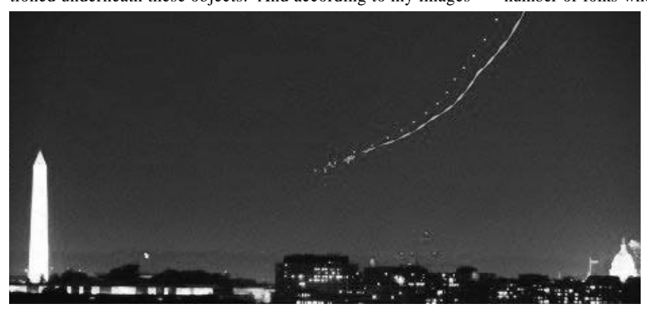
UFOs over the Washington Monument and Capitol Building, July 4, 2002.

Meanwhile, that same night, a father and son in Arlington, Virginia, had gone outside to get their cat off a ledge outside a second-floor window around 1.15 am. They were